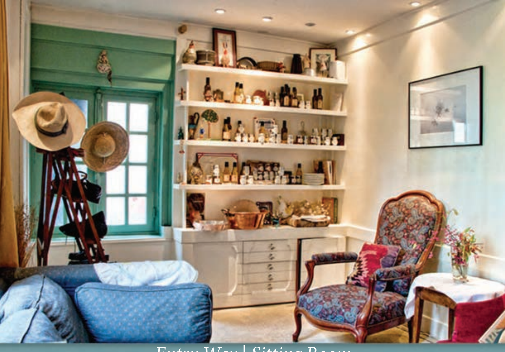
Entry Way | Sitting Room